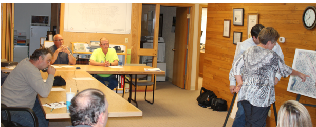
▲ Great West Led Community Planning Session

Scan to learn more about our planning capabilities.