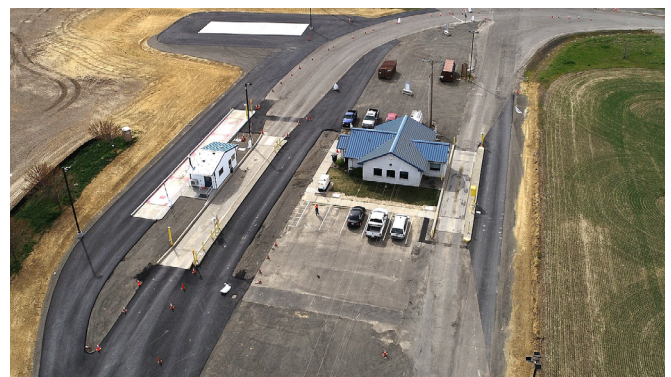
▲ New Scalehouse and Entrance Improvements | City of Walla Walla