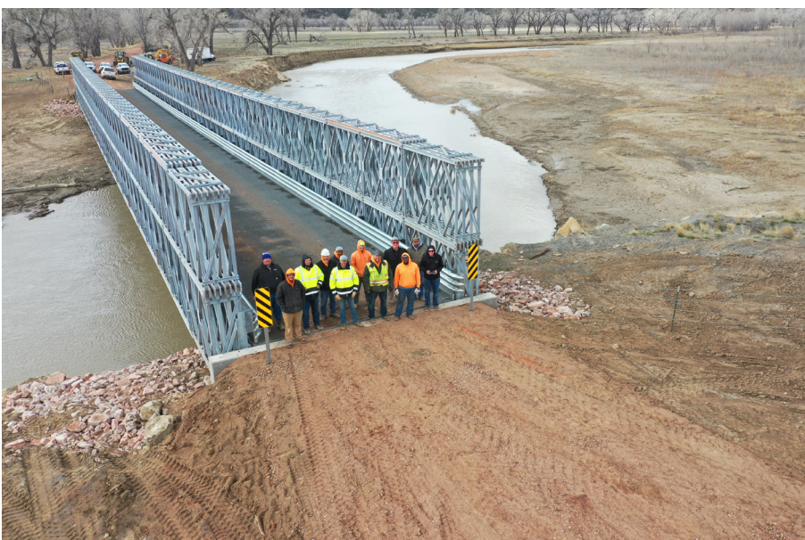
▲ EDA Funded Moorehead Bridge | Powder River County