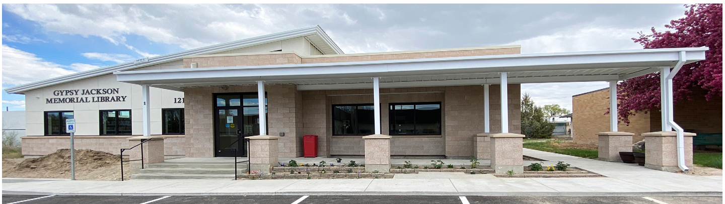
▲ Gypsy Jackson Memorial Library, City of Homedale | CDBG/Rural Envelpment Funding and Administration

In addition to helping clients apply for funding, we have spent a tremendous amount of internal resources and training to ensure our staff can assist clients with grant administration. Grant administration includes accountability for grant compliance and use of grant funds, compiling draw requests to disburse funds, compliance auditing, labor compliance, and project closeout. From project conception to project closeout Great West can provide project funding expertise to communities of all sizes.