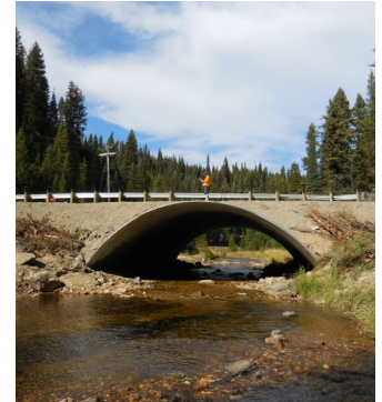
▲ American River Aquatic Organism Passage Culvert, One of Largest of its Kind