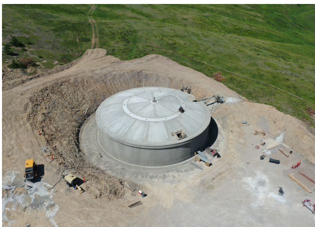
▲ Storage Tank Construction For Musselshell Judith Rural Water System, 230 Mile System Delivering Water to Seven Communities

Scan to learn more about our water capabilities.