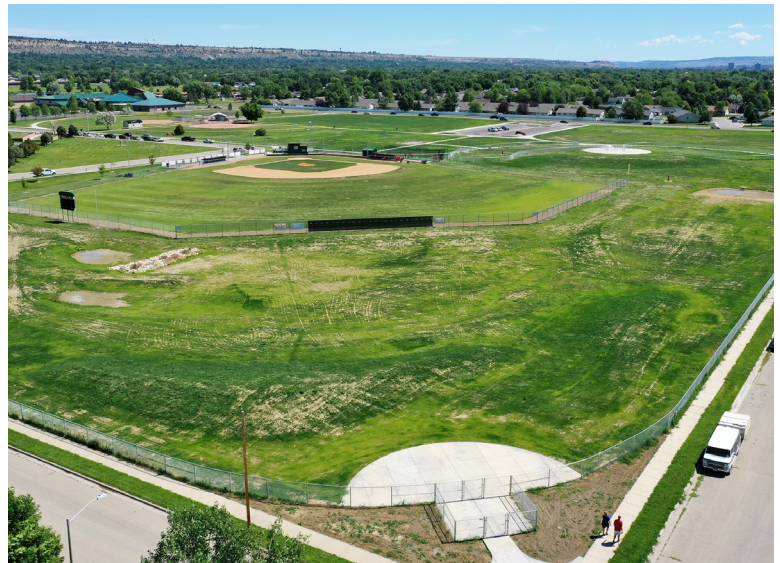
▲ Centennial Park | Billings