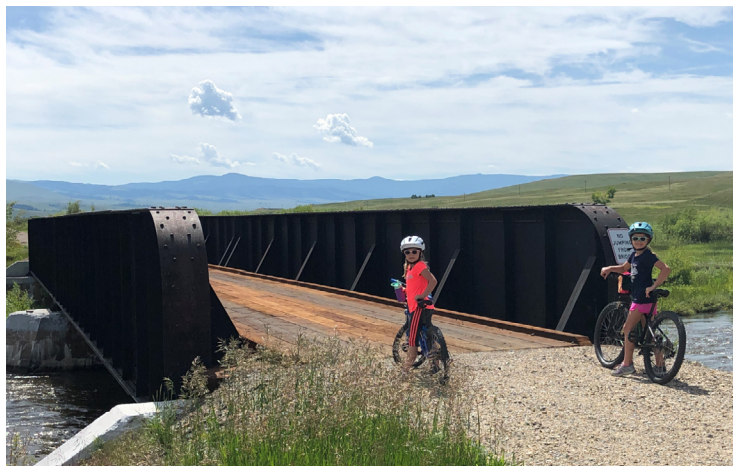
▲ Employee Family Members Take the First Ride on the Old Yellowstone Trail Project