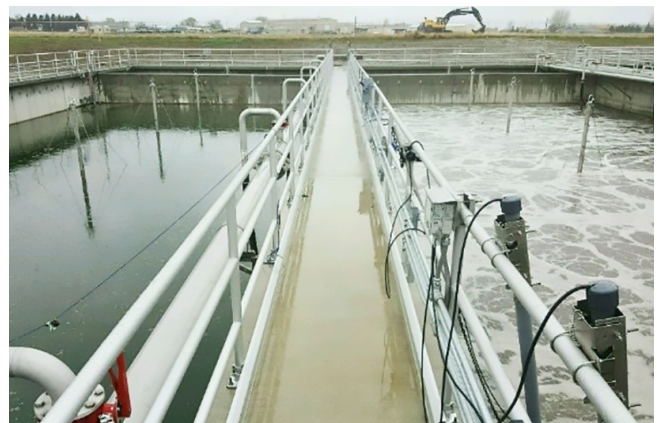
▲ ICEAS Mechanical Wastewater Treatment Plant | City of Glendive

Scan to learn more about our wastewater capabilities.