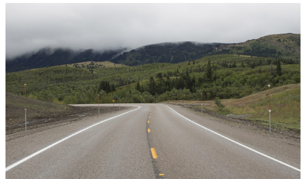
▲ Kiowa Jct N&S and N of Kiowa N | Montana Department of Transportation

Scan to learn more about our transportation capabilities.