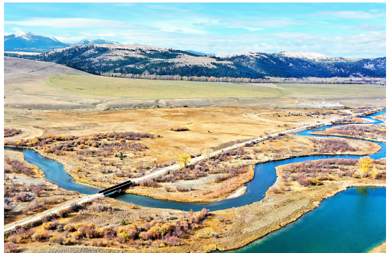
▲ Old Yellowstone Trail, Part of Rails to Trails System Spanning East to West of United States | Powell County

Scan to learn more about our parks and trails capabilities.